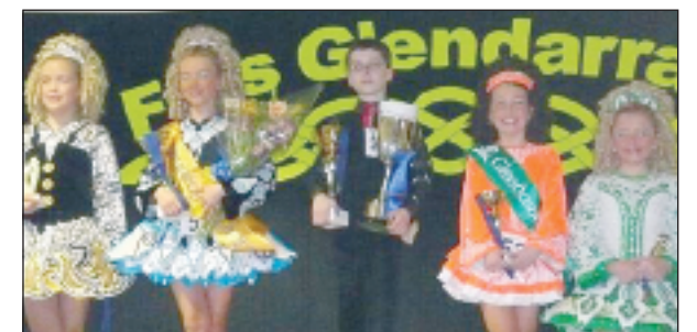
■ Under 12 Championship

The feis ran over two days and incorporated the grades, Preliminary and Open Championships with high entry numbers in all age groups.