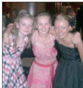
■ Kennedy girls enjoying their night