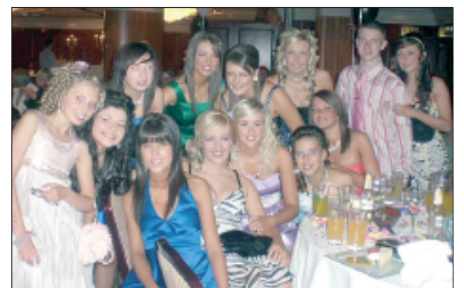
■ Some of the dancers