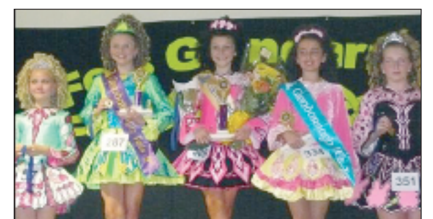
■ Under 12 Preliminary Championship